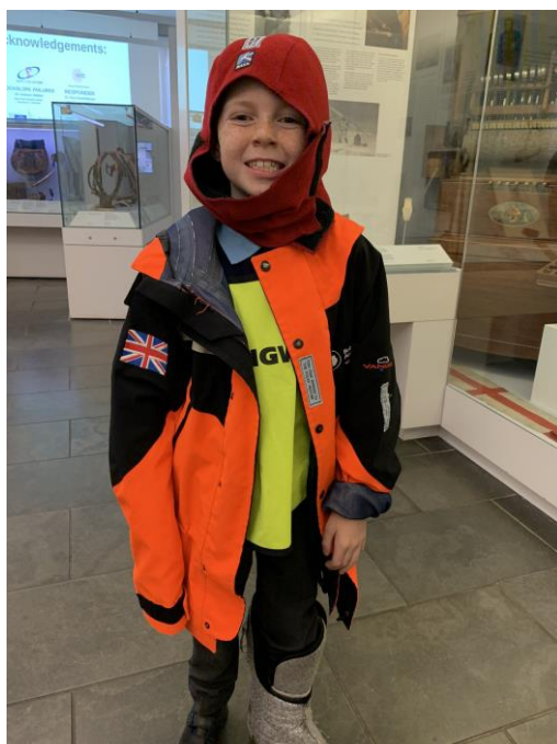
Year 5 visit the Polar Museum at the Scott Polar Research Institute in Cambridge

In Geography at The Bellbird, we aim to equip children with a wider understanding of different locations around the world and how they compare and contrast with each other. Children learn about how humans interact with their environment and the impact they have on the areas in which they live and on the wider world. They also learn about the physical geography of the Earth and vocabulary associated with its different features. Children develop their ability to interpret different sources of information including compasses, maps, photographs and graphs.