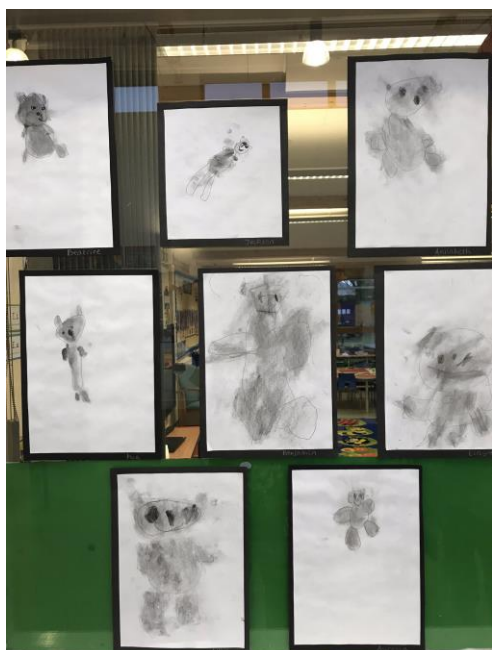
Observational drawings by Reception children using charcoal

During the preceding Summer Term, there are several opportunities for pre-school children to visit the School. There is time for parents to come into school to meet the staff and to be given an information pack concerning the school and the curriculum. Every child is offered visits to school before they start school, where their class teacher comes to meet them.