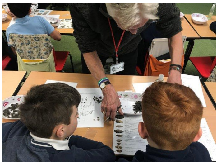
Examining owl pellets made at Science Club