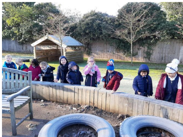
Children in year 1 investigating seasonal changes

Spending time outdoors in the natural world has huge benefits for children's physical and mental health. At The Bellbird, we recognise these advantages and are committed to giving children access