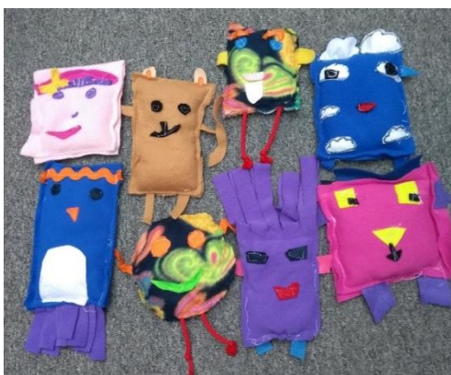
Funky wheat bags made at sewing club

We offer a variety of school clubs and groups which meet in and out of school hours. The school's policy is to encourage as much involvement from the children and interested parents as possible. These clubs range from sport based activities; tennis, dodgeball, multi-sports, to art based ones such as knitting club, drama club and coding club.