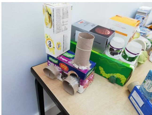
Tractors made using a range of materials from the recycling box