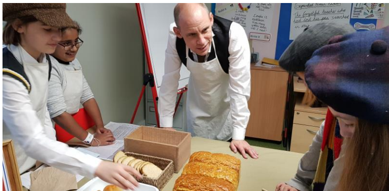
A World War II Day in Year 6

Who were the Mayans? How did the Egyptians build their pyramids? What did the Romans (ever) do for us? Why did Shackleton's Antarctic expedition fail so heroically? Who?, What?, Where?, When?, How? and most importantly, Why?, are the questions that drive our history curriculum. Through such a spirit of enquiry, the children will develop a sense of chronology, an understanding of the causes and consequences of events, the similarities and differences between historical periods and the role of the individual in forming the past. Visitors in, trips out, artefacts and a huge range of sources will help to spark the children's curiosity by bringing life to events from centuries past.